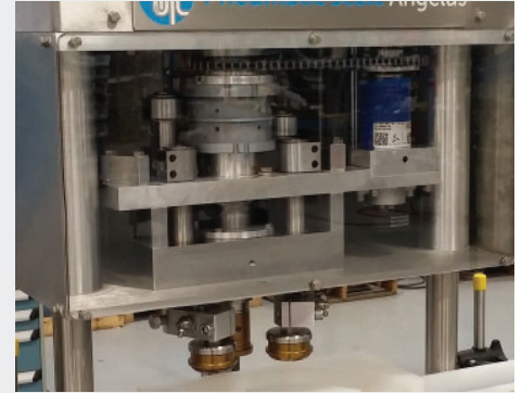
Seaming Cam and Levers